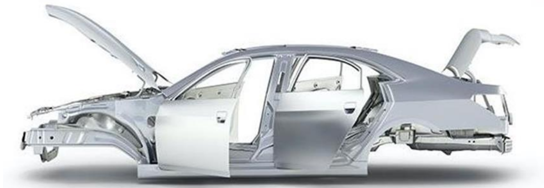
Figure 1. Aluminum car model.

Aluminum is the fastest-growing material in the car industry today. It is predicted that in 2026, every vehicle produced will contain an average of 12% aluminum (Huetter, 2020) [6]. In particular, the share of aluminum in today's fast-growing electric cars will show itself to be important. Innovative cars of the future will depend on aluminum.